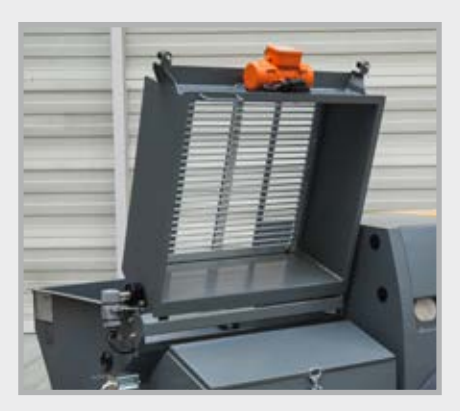
The grille and the enhanced vibrator ensure reliable, continuous material flow for an efficient pumping performance.