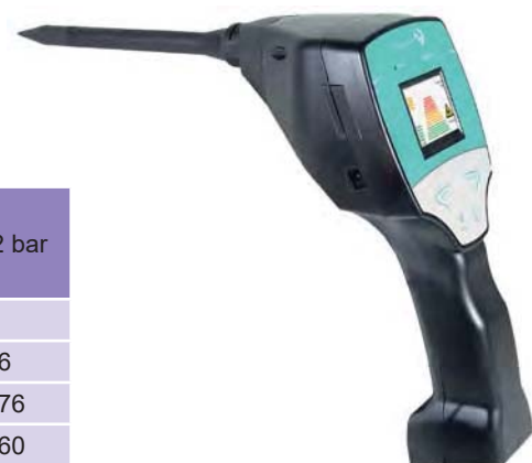
LD 400 with focus tube and focus tip for precise locating